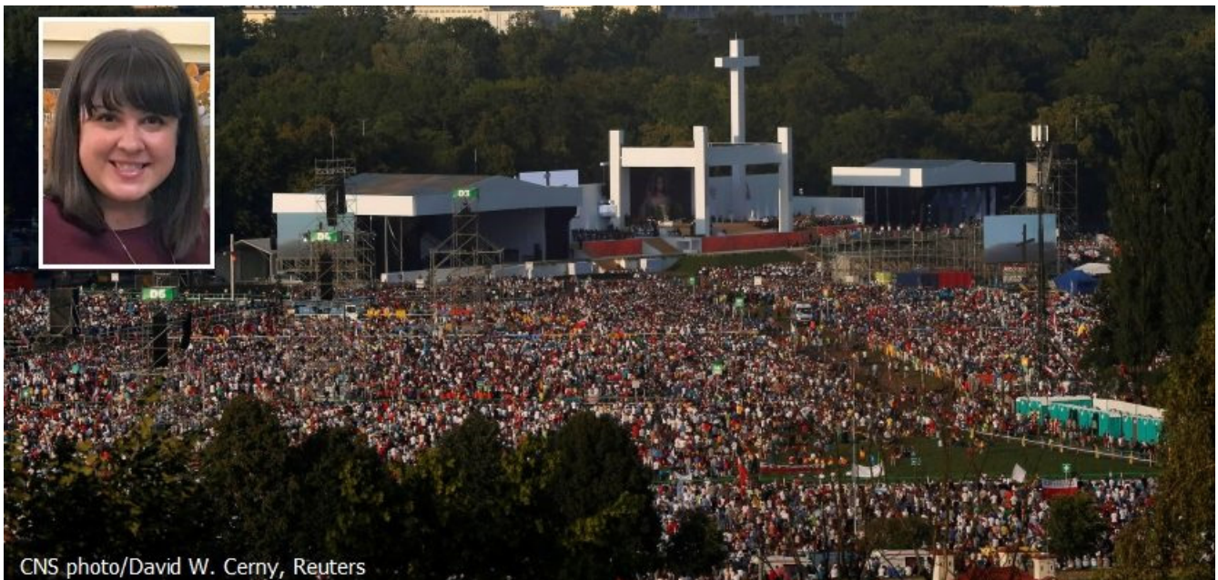
(Photo: Pilgrims gather at Blonia Park in Krakow, Poland during the Way of the Cross, part of World Youth Day 2016.